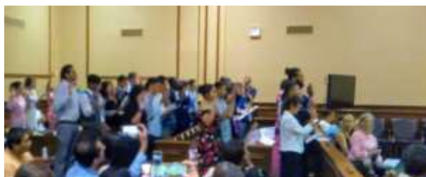
Two new citizens in the same ceremony!

Naturalization Exam Coaching: The Naturalization exam requires knowledge of 100 civics questions, writing a dictated sentence, and some conversational English. Many applicants are ill-prepared for this test,