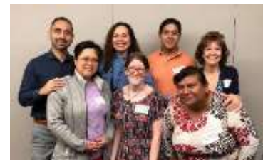
Meeting with Police Chief