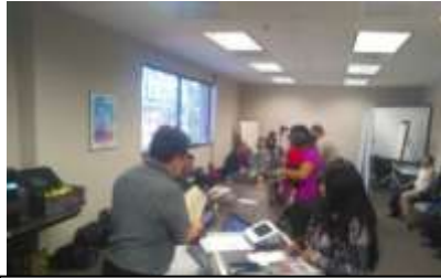
Mexican Consulate Visit

The first pillar of Sin Barreras' Mission is providing group services and workshops focused on Hispanic immigrant community needs. We hosted fifteen such events this year for over 1,388 attendees, a 14% increase from 2018. Two of these were facilitated for the Mexican Consulate offering 625 people the opportunity to process their Mexican government documents without an all-day trip to Washington, D.C. Eight other events were put on by the Charlottesville Community I.D. project where Sin Barreras volunteers, and others, supported 539 people signing up for local identification documents. Others included English as a Second Language classes each week, two financial literacy workshops, mammogram visits, a dental exam day, a tenants' rights workshop, and more. Not even