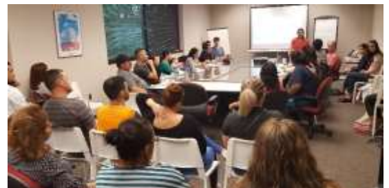
Financial Literacy Workshop

included in this total were 240 people who attended the "Multicultural Health Fair" co-hosted by SB, the Latinx Health Initiative, the National Coalition of 100 Black Women and other, which offered cardiovascular and diabetes screening, dental services, vision screening, stress reduction and other health care topics, and a similar number of people enjoying the Albemarle County Bike Fair afternoon.