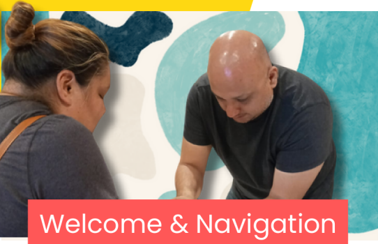
Welcome & Navigation

A safe and trusted place for urgent needs and information . We help directly when possible, connect to others when appropriate, and provide a welcoming space.