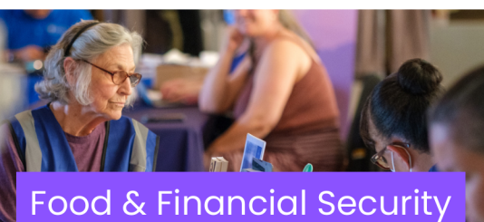
Food & Financial Security

Advocated for the needs of families to weather periods of hardship and insecurity related to the COVID-19 pandemic.