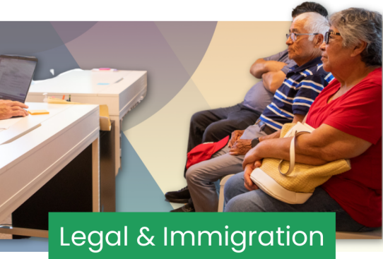
Legal & Immigration

Case work with non-attorney professionals accredited by the US Department of Justice to help in immigration. Major services delivered to over 540 immigration clients in seven years .