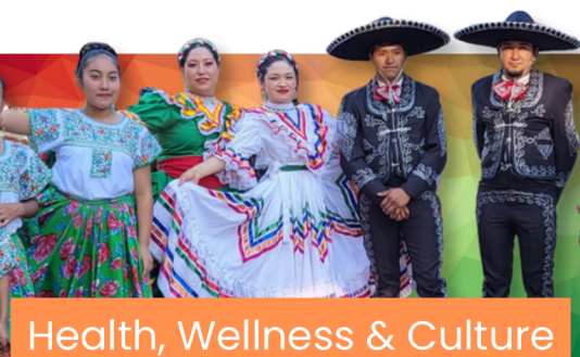
Health, Wellness & Culture

Assist with the coordination of mobile clinics and health-related informative sessions both in person and online. We coordinate cultural events, like Cville Sabroso , to celebrate our rich traditions.